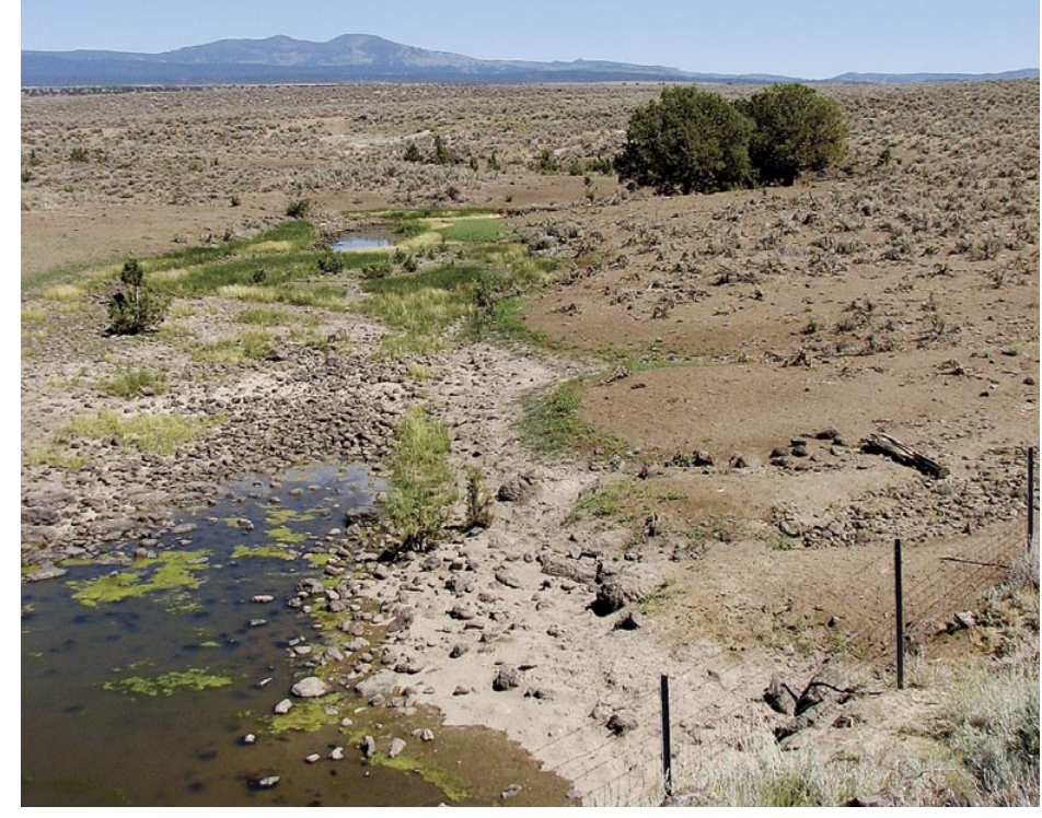
This review and analysis found that even the complete removal of juniper is not likely to significantly increase water yields in the California portion of the Klamath River Basin. Above , the Big Juniper drainage, between Alturas and Likely.

How much removal? The literature on how much juniper removal is required to increase water yields is limited. Bosch and Hewlett (1982) proposed that the amount of vegetative cover removed is proportional to changes in water yield and that, for many areas, removing less than 20% of the cover would not yield detectable changes in stream flows. In contrast, Hibbert (1983) reported that the relationship between percentage of vegetation removed and reduced transpiration is nonlinear, and that meaningful reductions in transpiration in arid environments are only achieved at high levels of removal. For instance, removing half of the deep-rooted vegetation may hypothetically result in only a 20% reduction in transpiration.