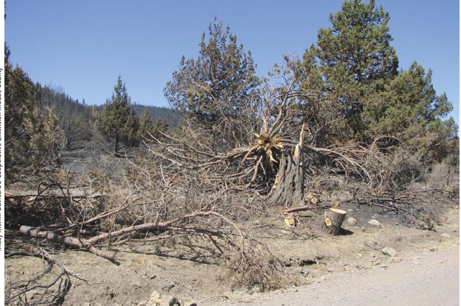
Numerous juniper removal projects have been implemented in the Klamath River Basin, including by cutting and prescribed burning.

However, this method of increasing water yield to arid watersheds in the eastern Klamath River Basin must be applied cautiously. Examining studies in arid and semiarid lands, Hibbert (1983) concluded that less than 1% of rangelands in the western United States are conducive to being successfully managed for increased water yield by vegetation conversion.