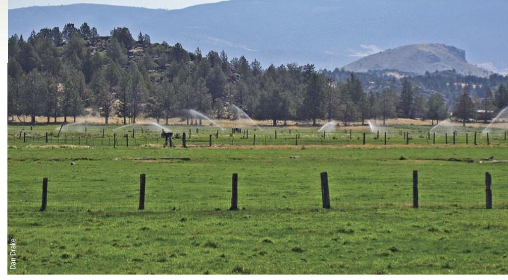
In the Klamath River Basin, water for irrigation, power, drinking and wildlife is scarce, and competition for this limited resource remains intense. In recent decades, the range of native juniper (background), a water-demanding tree, has expanded in the region due to fire suppression and land-use changes.

In 2001, for example, water shortage forecasts in the Klamath River resulted in the closure of agricultural irrigation supplies in order to maintain adequate in-stream flows for salmon runs. Levy