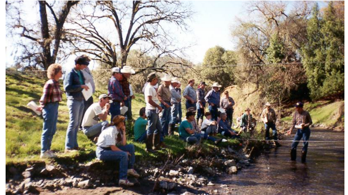
Figure 2: Water Quality Planning Short Course, Mendocino County