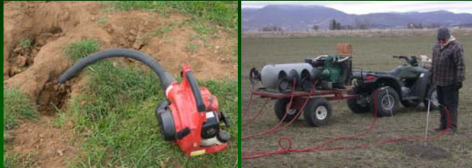
Carbon monoxide producing machines