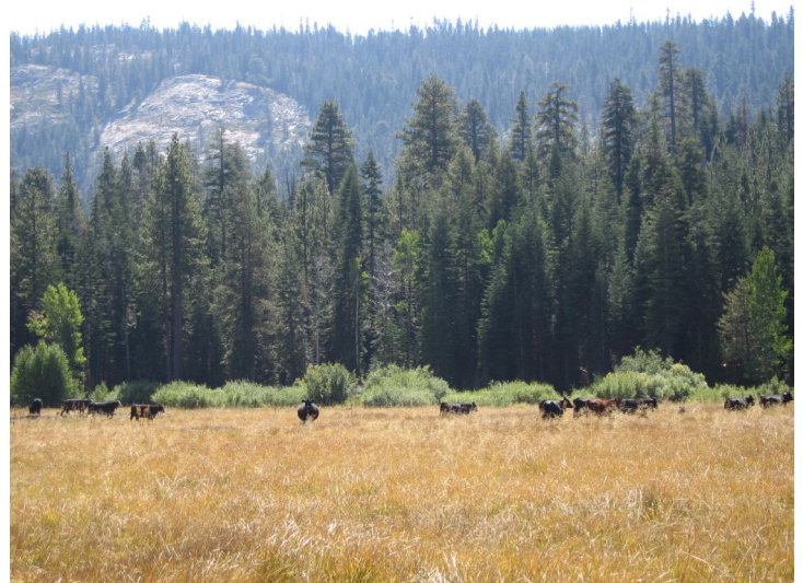
Cattle grazing a mountain meadow on the Plumas National Forest.